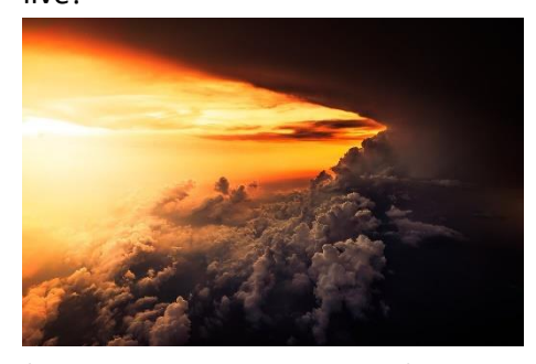
(Read 1 Corinthians 9:25-27)

term. Heaven is the time to really live!